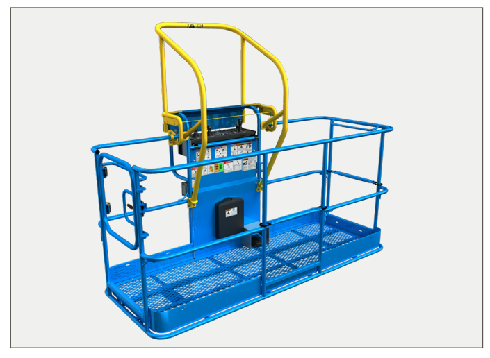
Figure 1. Example of physical barrier