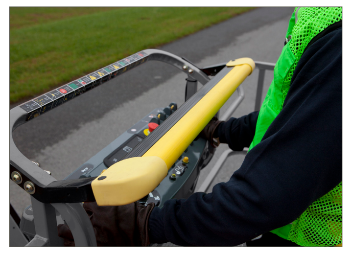
Figure 2. Example of pressure sensing device