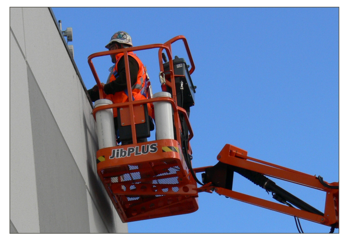
Figure 3. Minimal overhead structure in proximity