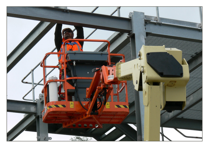
Figure 4. Multiple overhead structures in proximity

• a 'lower-before-travel' policy, where workers are instructed that they must lower scissor-type MEWPs to be completely clear of any overhead structures before driving/travelling in the unit