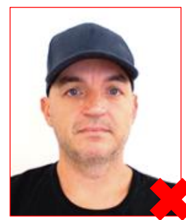
Hat must not be worn