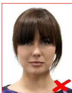
Hair must not cover face