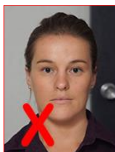
Background should be plain white