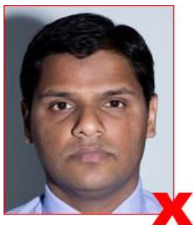
No shadows on face