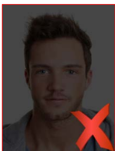
Photo must not be too dark