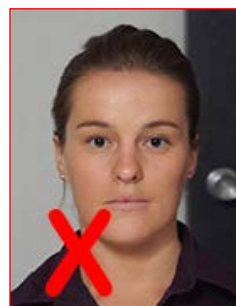
Background should be plain white