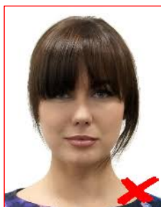
Hair must not cover face