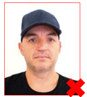
Hat must not be worn