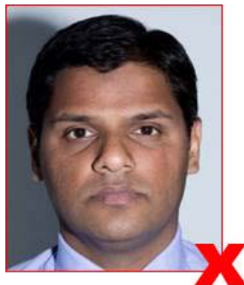
No shadows on face